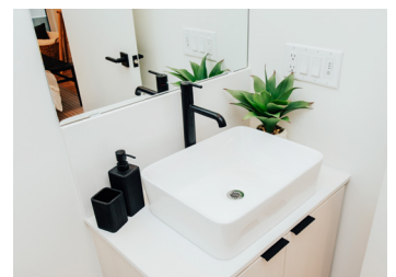
*Model suite photos for demonstration purposes only.