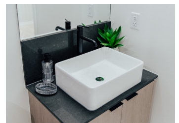
*Actual photos of Suite 409.